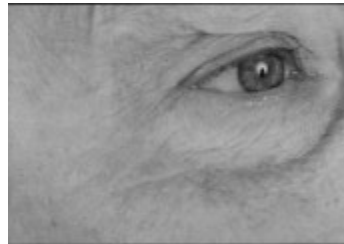
After 120 Days Treatment with Topical Peptide Secretagogue