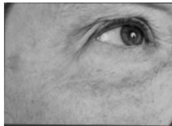
After 180 Days Treatment with Topical Peptide Secretagogue

hormone or an enzyme. The goal for a growth hormone secretagogue, for example, is to encourage the pituitary gland to release growth hormone. While direct hGH injection causes the body to act as if the pituitary has released growth hormone, a secretagogue actually causes the release of it. The ultimate result is similar. However, secretagogues are generally less potent and sold over the counter as nutritional supplements rather than as a drug. As far as hGH is concerned, numerous nutrients can act as secretagogues, including amino acids such as glutamine, lysine, and arginine. Specialized short chain peptides also act as secretagogues to enhance growth hormone release from the pituitary gland, and next to injecting hGH, this is perhaps the best alternative. Having the right delivery system is critical, as peptide secretagogues are easily denatured when they come into contact with gastric juice. Oral intake of such secretagogues will lead to enhanced growth hormone levels, which in turn will lead to more collagen synthesis. With secretagogues, injection of human growth hormone can therefore be avoided.